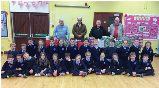
St Joseph's Primary School, Ederney