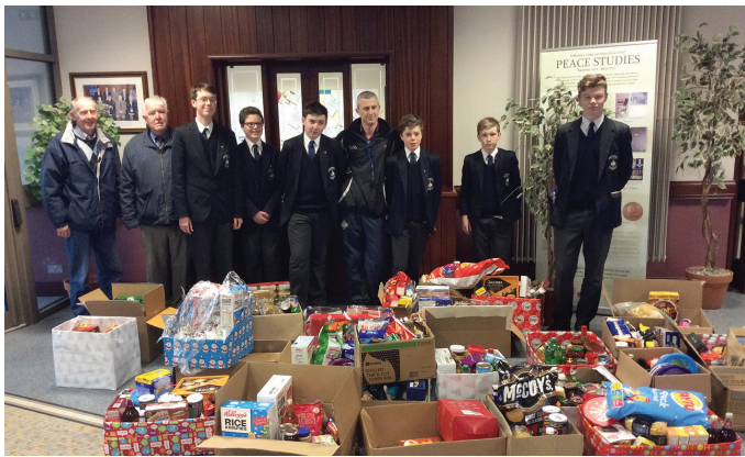
St Michael's College, Enniskillen

Thank you to all the local schools and organisations which donated Christmas hampers to those less fortunate in our society.