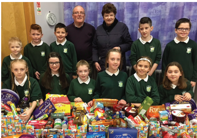
St Patrick's Primary School, Ballynahinch