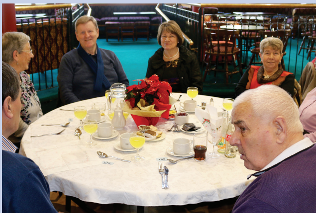
Members of Banbridge Conference enjoying their Christmas dinner.