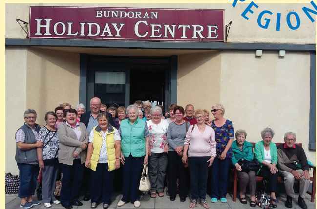
Enjoying a weekend at the Ozanam House Holiday Centre are a group from Cookstown Conference.